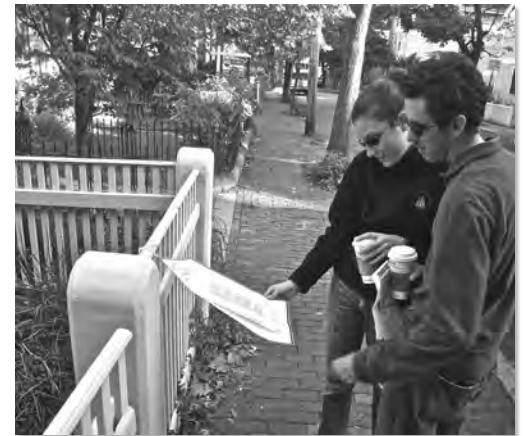
Fig. 1. With If this house could talk.. the neighborhood itself becomes the exhibition.