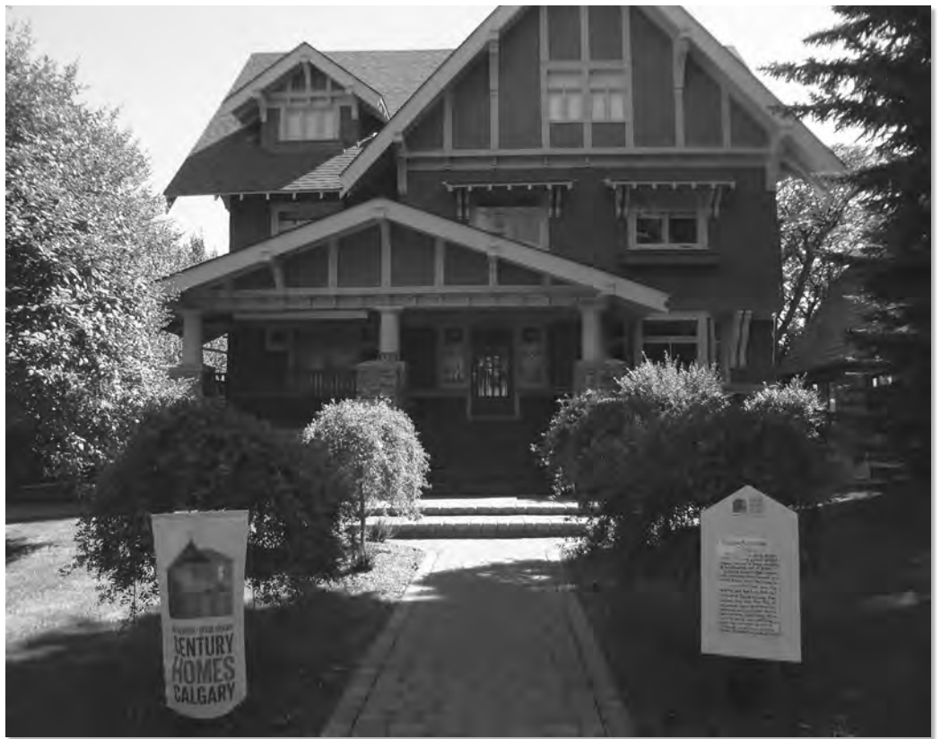
Fig. 3. Calgary's event celebrated the city's first building boom, when the railroad came to town. This bungalow was built in 1913.

Calgary Week. The goal of the project was to celebrate Calgary's old homes—most of them about 100 years old, built during Calgary's first boom—with the hopes of ensuring their preservation. The CHI was concerned about losing historic homes to new development, a problem in many inner-city neighborhoods.