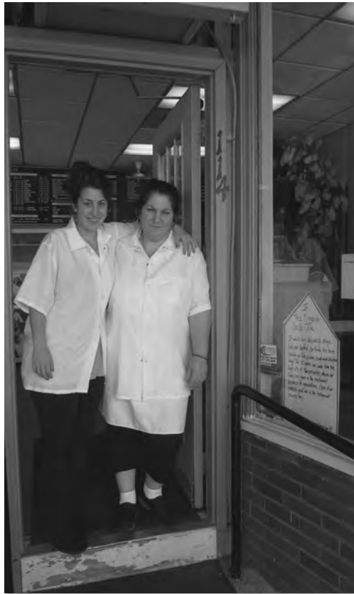
Fig. 6. Sign writers are proud to share their stories. This sign, at Cambridge's Village Grill & Seafood, told how the owners had traveled thousands of miles from Greece to start a business and to live the American dream. The sign says that their best dishes are "delicious pizza" and "fresh baked haddock," delivered from Georges Bank three times a week.

ITHCT challenges traditional museum hierarchies and methodology, and the result is a vibrant public history happening (fig. 6). Consider trying it yourself! You are welcome to use the name and our template; just let us know about your project so that we can post it to the website. ✨