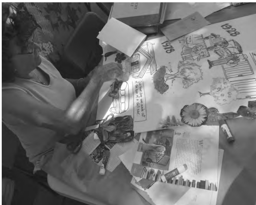
Fig. 4. Sacramento's signs, inspired by artists and storytellers, were colorful in word and look. This sign features bright green trees, red printing, and flowers in shades of yellow and lavender.